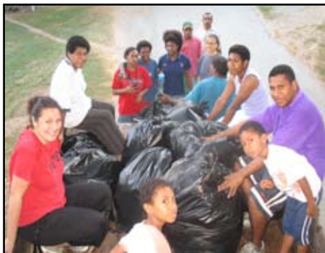
Done at last: volunteers with the rubbish that was collected.

The days agenda is to give a human face to environmental issues; empower people to become active agents of sustainable and equitable development; promote an understanding that communities are pivotal to changing attitudes towards environmental issues; and advocate partnership, which will ensure all nations and peoples enjoy a safer