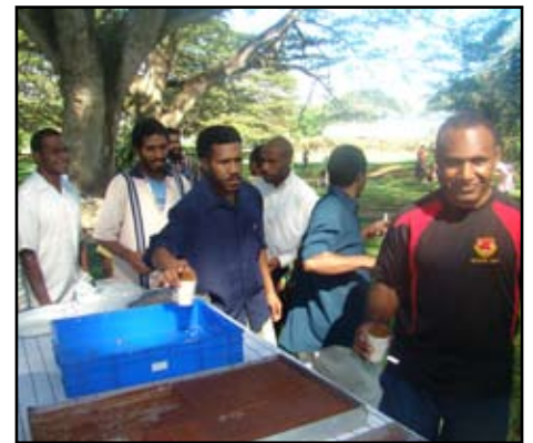
Students being served their dessert during the PNGUM bung on Sabbath.