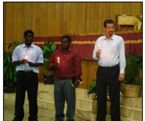
Candle lighting symbolizing the gospel to be spread throughout the world.