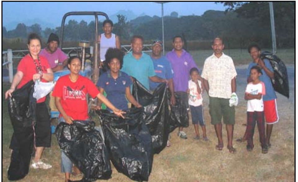
PAU Volunteers clean up for World Environment Day at the Main Gate.