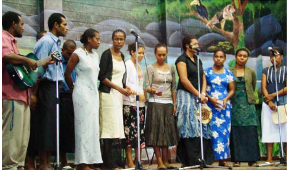
PAU Fijian students presenting a song at the PNGATSA Combined Worship.